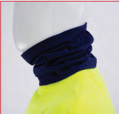
Wear it as a Gorgette