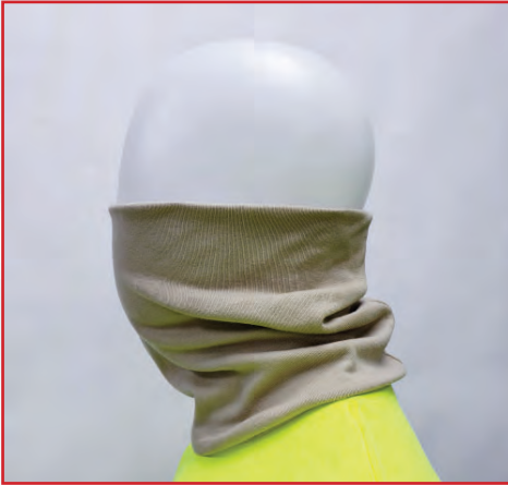
Wear it as a Face Covering