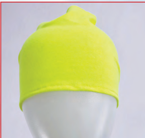
Wear it as a Head Covering