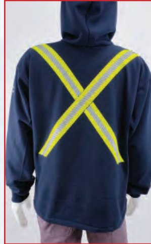
TSG-3505-1-N Yellow/Silver/Yellow Hi-Vis Striping in Cross Buck Configuration