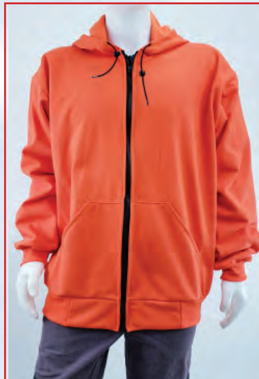
TSG-3507-O Orange Fleece Zip-Up Hoodie

We also make gloves; it's right in our name!