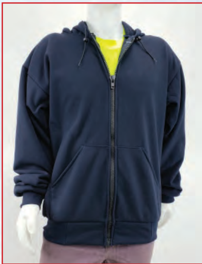
TSG-3507-N Navy Fleece Zip-Up Hoodie