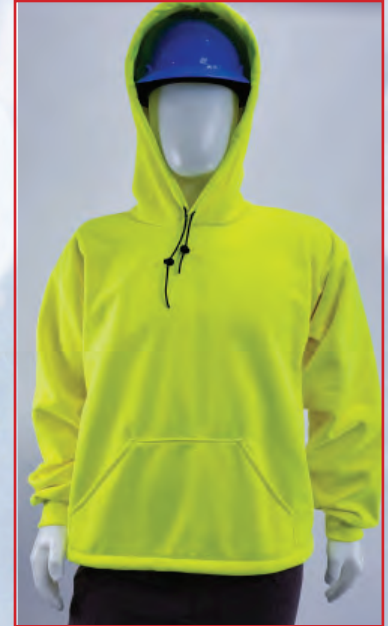
The Hood is Designed to Fit Over a Hard Hat